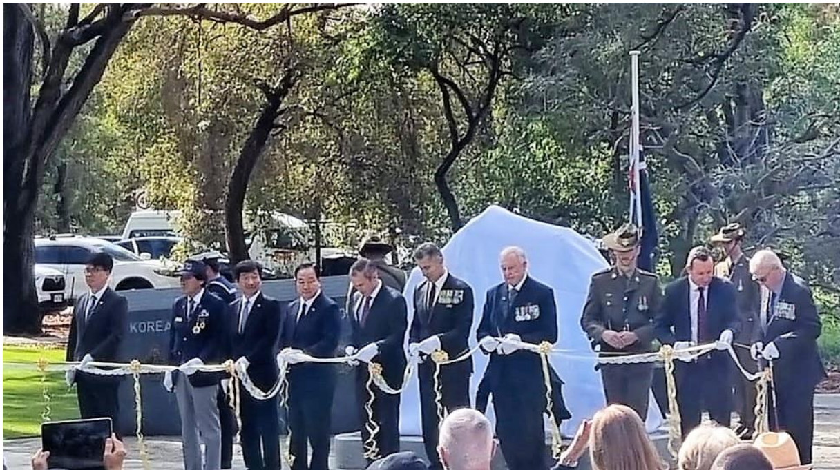
VIPs led by the Premier and Korean Ambassador cut the ribbon to open the Memorial Stone.