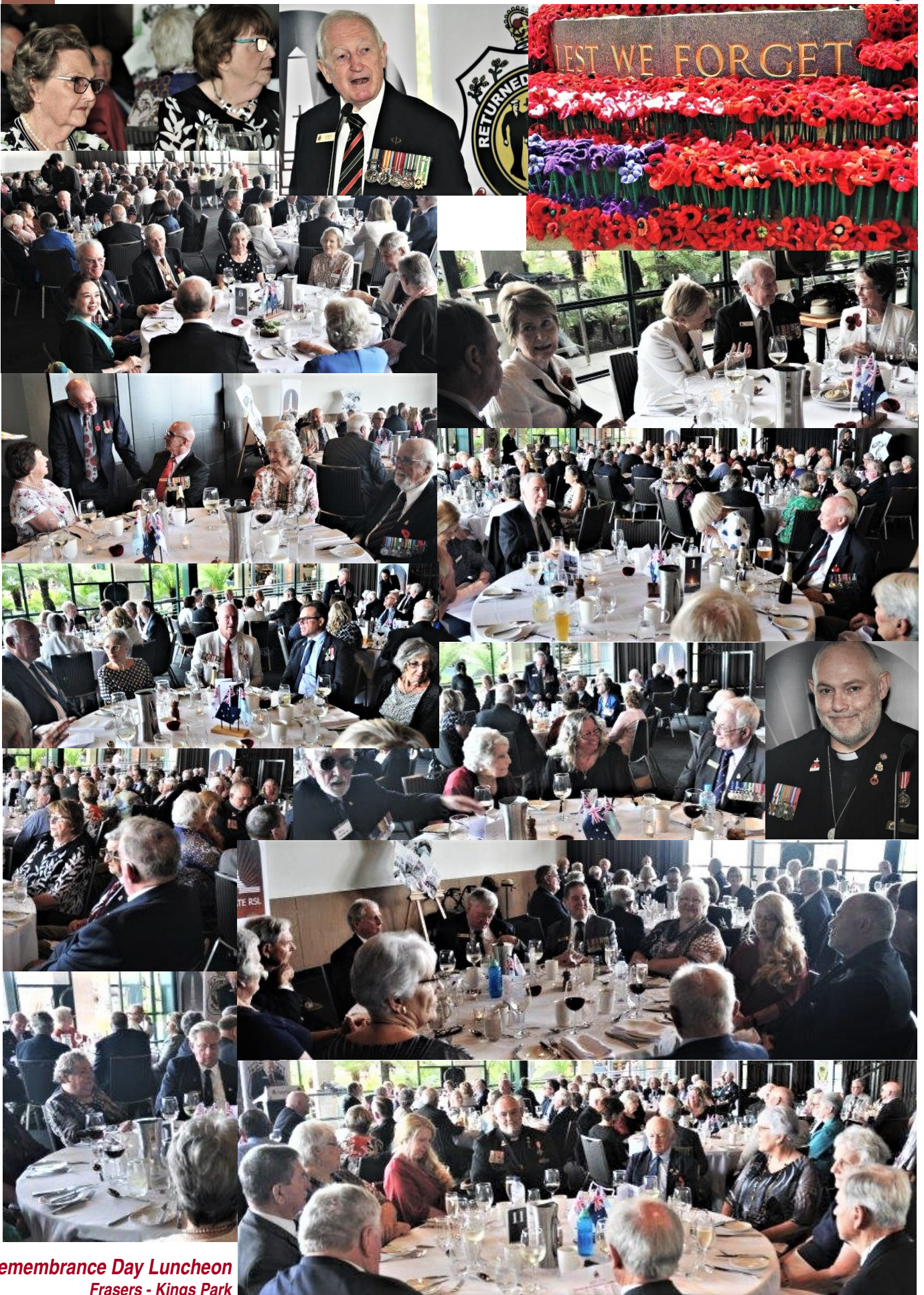
Remembrance Day Luncheon Fraser's - Kings Park