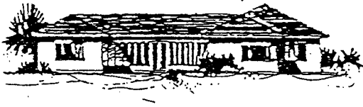
Barbara Seabrook House

Outreach of Ryder-Cheshire Foundation (Western Australia) Inc.