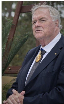
WA Governor Kim Beazley AC

Despite adverse weather conditions with driving rain and wind, around 2,000 people including Government Ministers attended this inaugural State and public dedication ceremony.