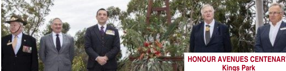
HONOUR AVENUES CENTENARY Kings Park 03 August 2019