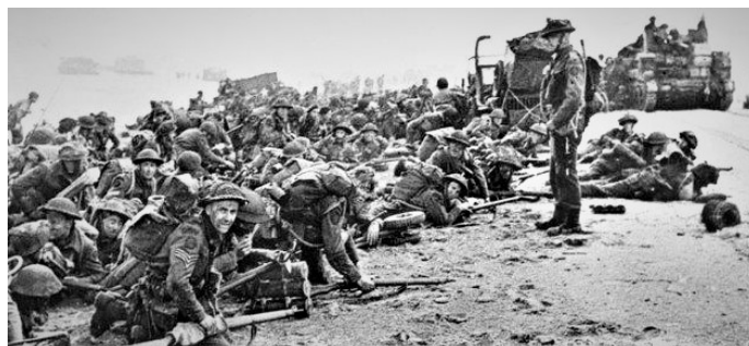
British troops on a Normandy beachhead wait for a tank to pass before advancing against the enemy