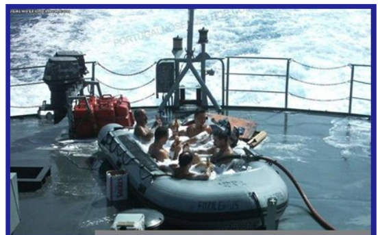
Navy: It's nice to swap a shower for a bath in a Zodiac sometimes

Some of today's service-personnel at play, whilst at work. 'Tis good to see that some things never change.