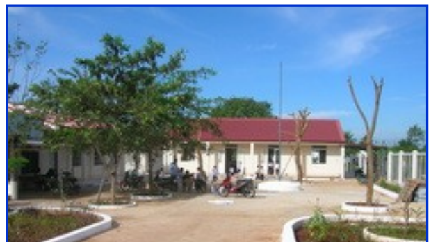
The school AFTER renovations and new works completed including productive vegetable gardens

The continuing support of Hollywood Private Hospital and their generous assistance to RSL Highgate Sub-Branch is warmly and greatly appreciated.