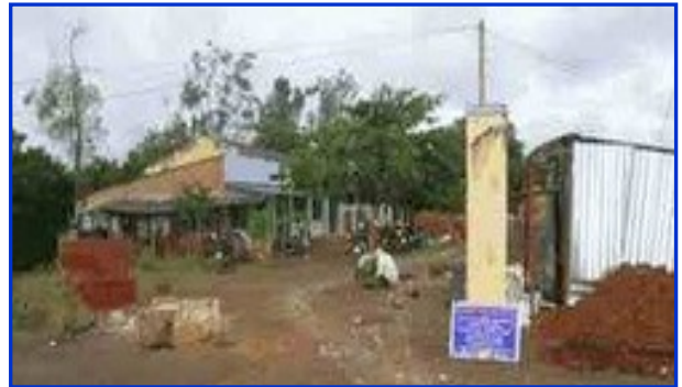
The damaged school at Nui Dat as it looked BEFORE repairs began (workers' shed (R) foreground)