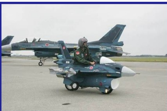
Air Force: Sophisticated scooter

Some of today's service-personnel at play, whilst at work. 'Tis good to see that some things never change.