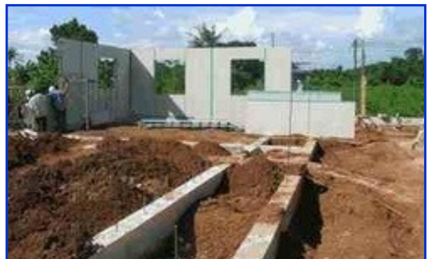
Earthworks, foundations and the new classrooms taking shape