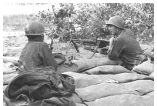
3 RAR machine-gun position at FSB Balmoral