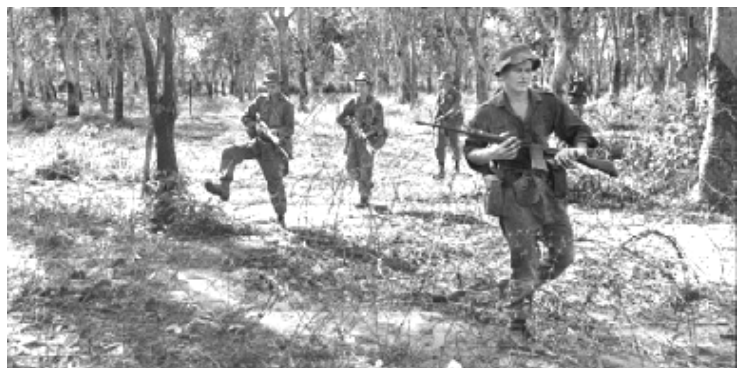
D Company, 1 RAR entering FSB Coral after a patrol