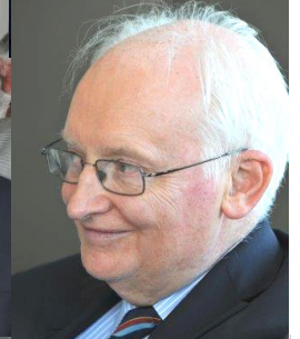
Highgate RSL March Luncheon Guest Speaker Brian Burke Former Premier of Western Australia