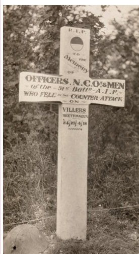
51st Battalion Memorial Cross erected on the battlefield of Villers-Bretonneux in 1918

The Sunset Services will allow those unable to attend the ANZAC Day Dawn Service to pay their respects and remember those who served Australia with courage and dignity.