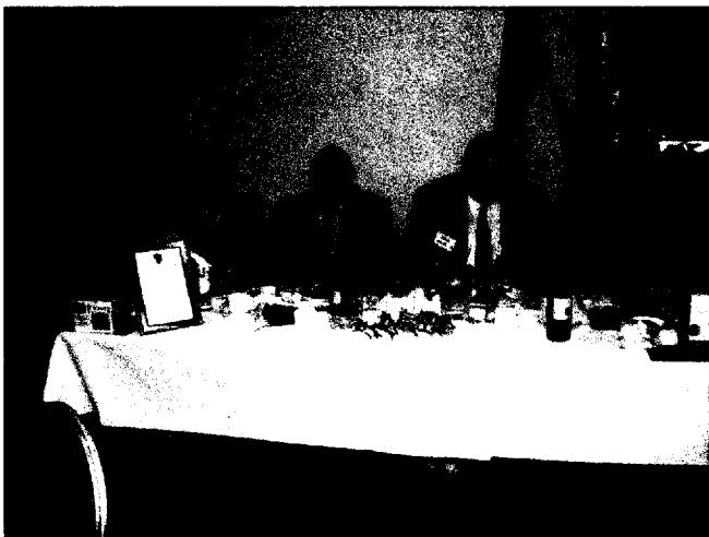
Christmas Priorities — Food before Photo