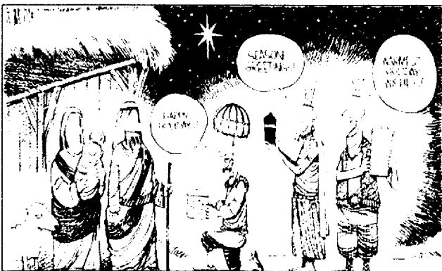
After the wise men left along came the three politically correct guys.

As he was drilling a batch of recruits, the sergeant saw that one of them was marching out of step. Going to the man as they marched, he said sarcastically: