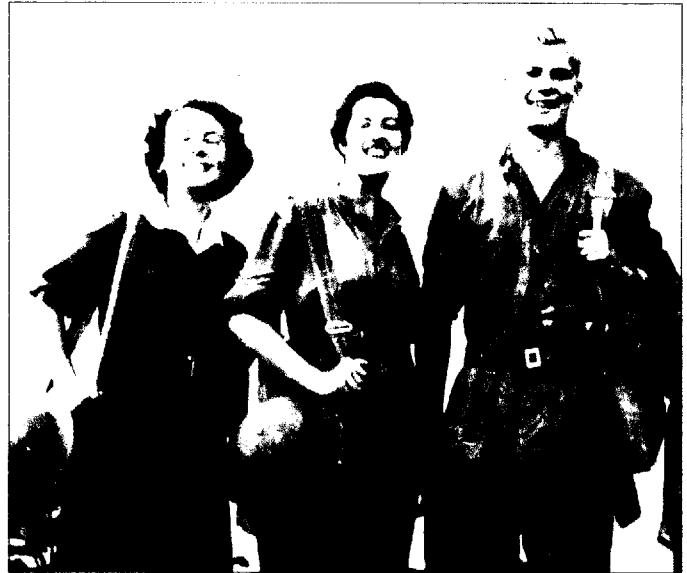
23 Radar Station—Operators and Mechanic going on shift.

"Well, Sarge, you're in charge -- you tell them!"