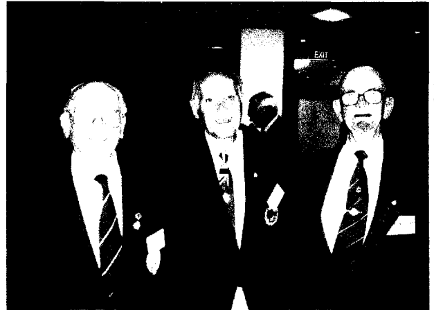
At the AGM