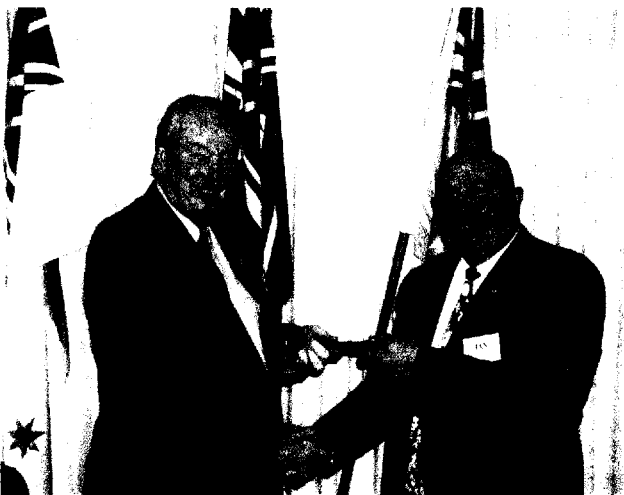
Handsome? is as Handsome does.