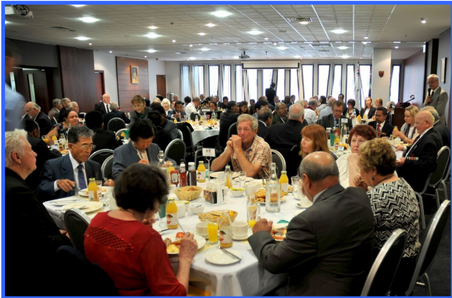
Some of the Highgate crowd who gathered for the Gunfire Breakfast

Highgate has enjoyed listening to many impressive Guest Speakers at its annual ANZAC Day Gunfire Breakfasts over the years, but 2016 marked a very special difference! For the first time ever, we were addressed by a former Head of State: Xanana Gusmao - the first elected President of independent Timor-Leste (East Timor).