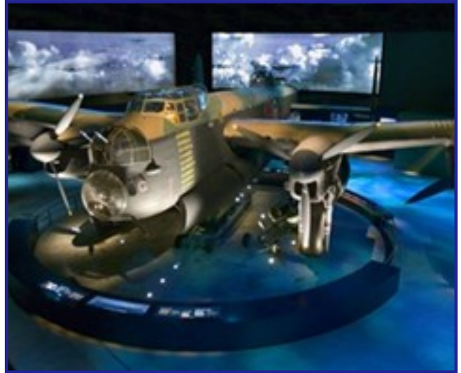
The Lancaster Bomber: "G for George" which features in a moving Sound and Light show several times daily

Flanking the Parade, on each side, are the various Memorials to such Conflicts as the Vietnam War, the Korean War, and