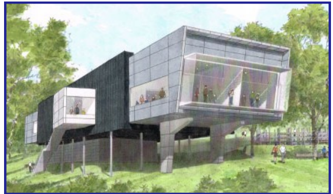
Still under construction: the National ANZAC Interpretive Centre ALBANY

www.anzacalbany.com.au will tell you more!