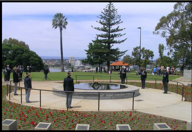
Highgate Sub-Wardens on duty at the Flame of Remembrance