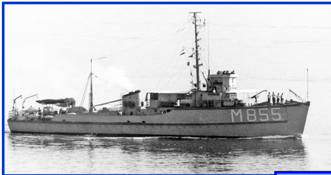
(Above) "PAX", as she was as 272-tonne Dutch Minesweeper "Breskens" and (R) as she looks today

He, in turn, unable to on-sell it, kindly "gifted" the vessel to a worthy, non-profit organisation who would put it to good use.