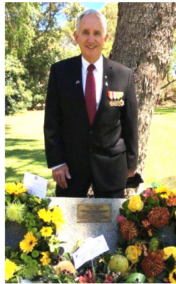
after the service