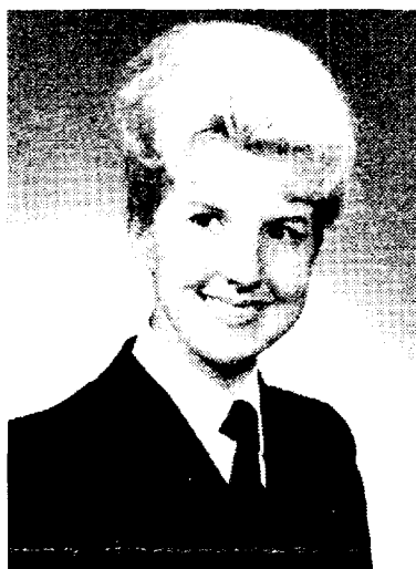
(even more beautiful today)